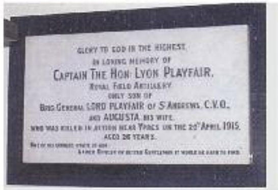
The Playfair Memorial Window and tablet, St Marys Church, Redgrave, Suffolk