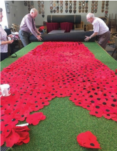
The Chairman (right) assisting in the construction of the Cascade in the Church hall