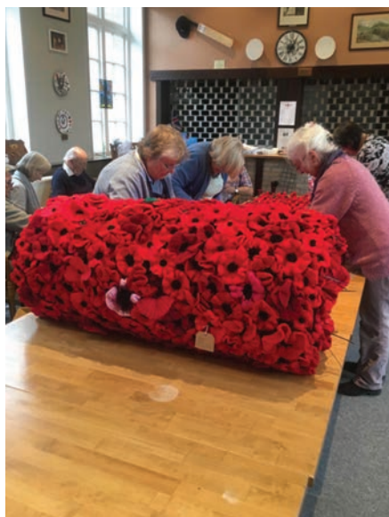
Volunteer helpers putting the finishing touches to one of the Cascades (left) and those to be displayed on the Church railings (right)