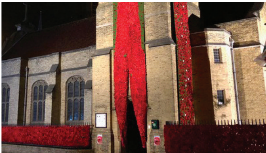
Night falls on the Poppy Cascade at St. George's