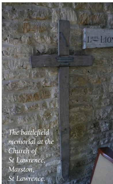
The battlefield memorial at the Church of St Lawrence, Marston, St Lawrence.