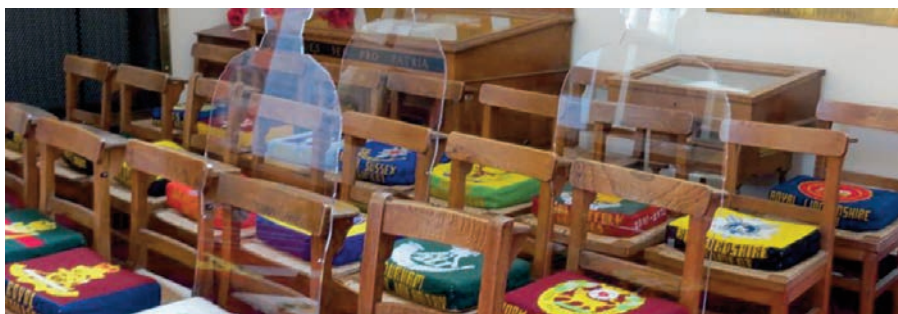
'Tom, Dick and Harry' sit silently in St. George's

The church was built in 1927 by the architect Reginald Bromfield who also designed the Menin Gate and the Cross of Sacrifice which may be found in all Commonwealth War Grave cemeteries. The intention was that the interior would serve as a memorial to individuals, families, schools and the military units themselves who in many cases donated many items of furniture, plaques, windows, the font and the altar. To emphasise the memorial identity of the church a replica of the CWGC Cross of Sacrifice was installed on the roof directly above the altar. It was the intention of the Founders of St George's Memorial church that we should provide an ongoing ministry of the remembrance of the fallen and pastoral care to their families and descendants who still continue to come here as pilgrims one hundred years after the events of the Great War. The 'There But Not There' silhouettes mark the latest phase of an ongoing memorial ministry at St George's church which is illustrated by a range of unique commemorative monuments including wall plaques, stained glass windows, regimental banners and standards, embroidered coloured kneelers and the peal of memorial bells.